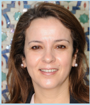
Charafat Afailal El Yedri

Secretary of State to the Minister of Equipment, Transport, Logistics and Water, in charge of water