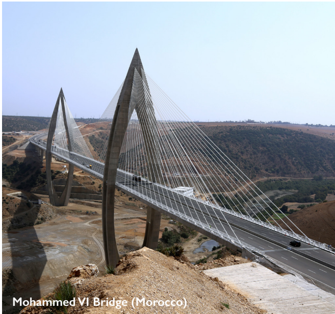
Mohammed VI Bridge (Morocco)