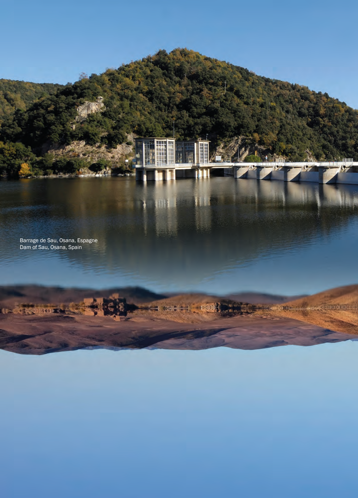
Barrage de Sau, Osana, Espagne Dam of Sau, Osana, Spain