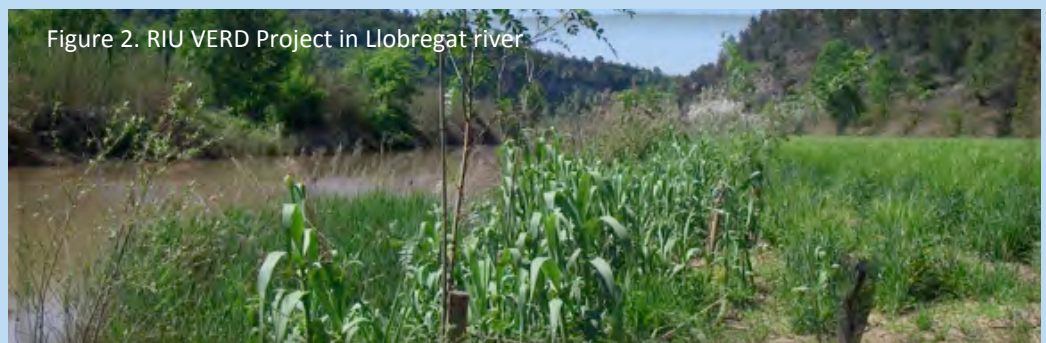
Figure 2. RIU VERD Project in Llobregat river

Furthermore, these economic benefits of river restoration were viable even after both treatment facilities had installed new and sophisticated water treatment technologies. In 2009, the water purification plant managed by Aigües Ter-Llobregat (ATLL) in Abrera installed an electro dialysis reversal, while simultaneously the water purification plant of Aguas de Barcelona (ABGAR) invested in a reverse osmosis system. Therefore, regardless of the technological context, investing in ecosystem services may make economic sense (Honey-Rosés, Schneider & Brozovic 2014).