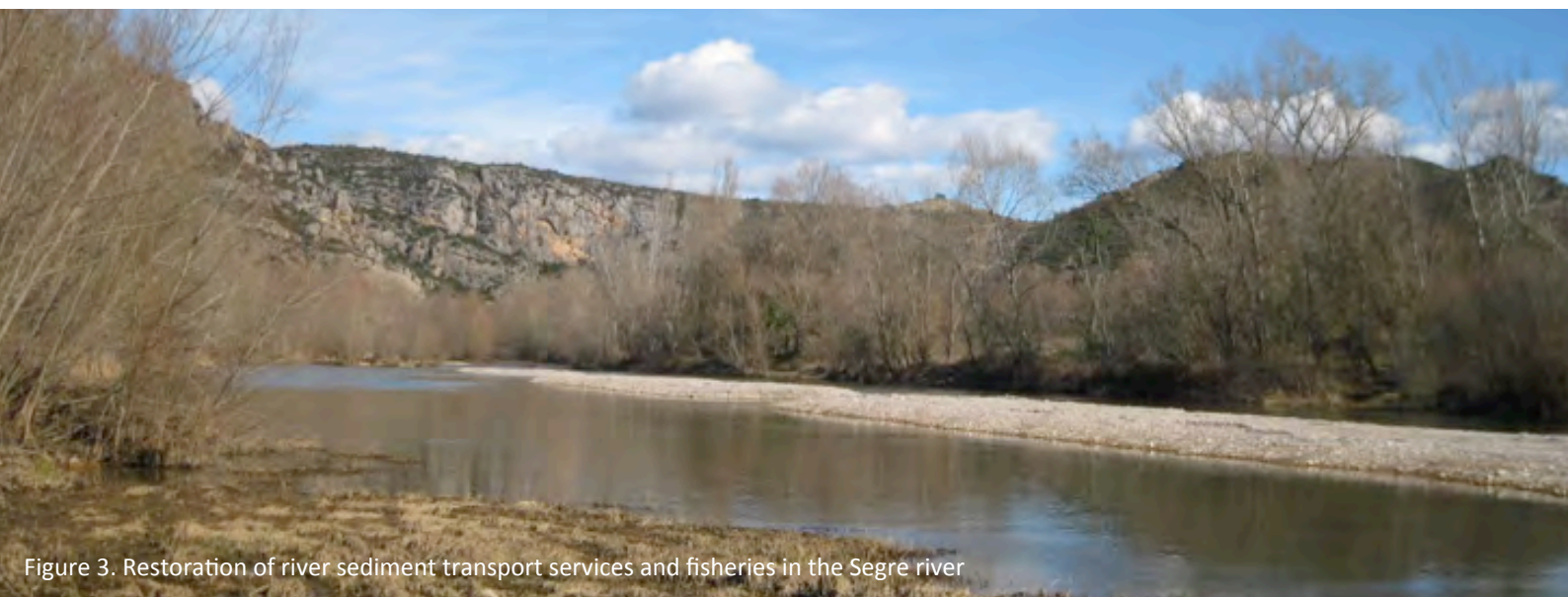
Figure 3. Restoration of river sediment transport services and fisheries in the Segre river